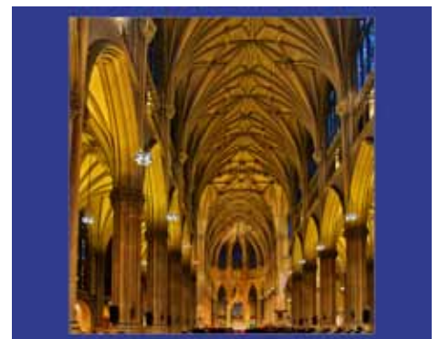
2nd: Benjamin Todd