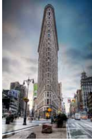
1st: Chuck Vosburgh