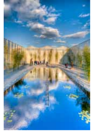
1st: Chuck Vosburgh